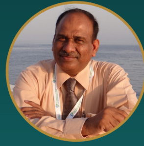
Rakesh Agrawal: Former Registrar General, Protection of Plant Varieties and Farmers Rights Authority, India